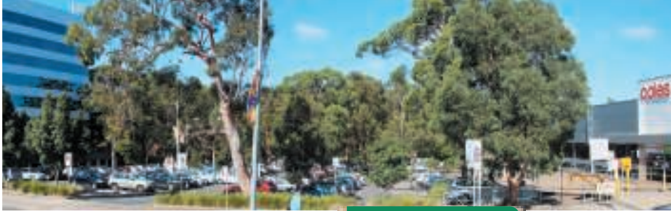
Rawson Street car park