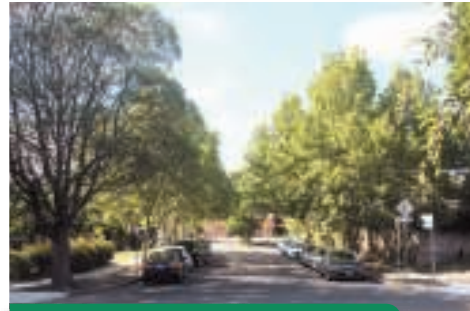
Pembroke Street / Chambers Court area

upon these public lands and exceed development controls. This is bad news. It is therefore very important that the Councils take the initiative by accelerating the planning for the town squares (civic precincts in the latest planner jargon) and seek the views of the community at the earliest possible time.